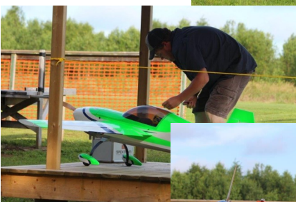
South West Flyers Yarmouth.